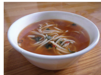
Bowl of soup