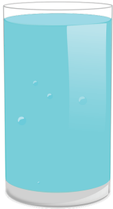
Water in a glass