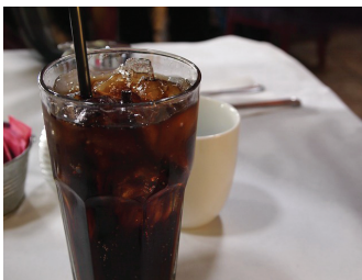
Cup of cola